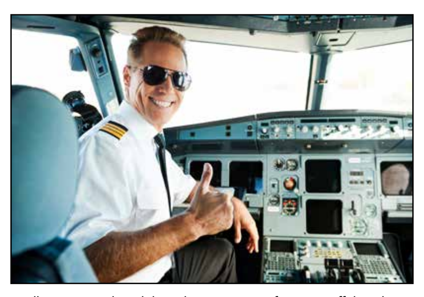
I will stay seated until the pilot says it is safe to get off the plane.