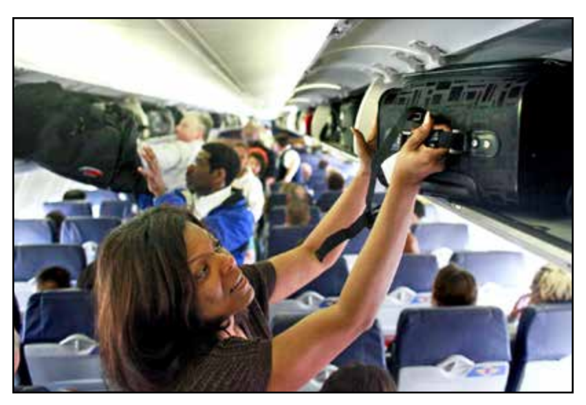
I will need to be patient while passengers get their luggage from the overhead compartments.