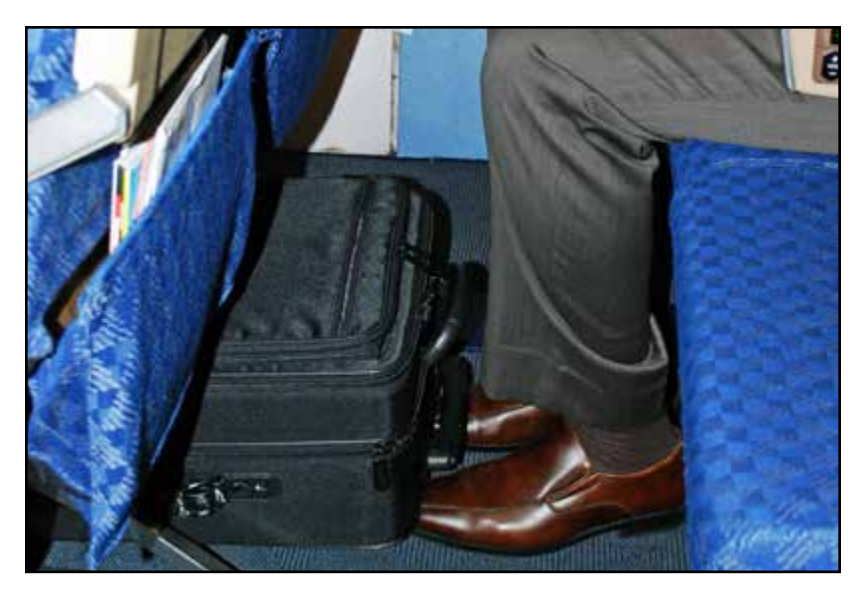
Once I find my seat, I can put extra luggage underneath the seat in front of me.