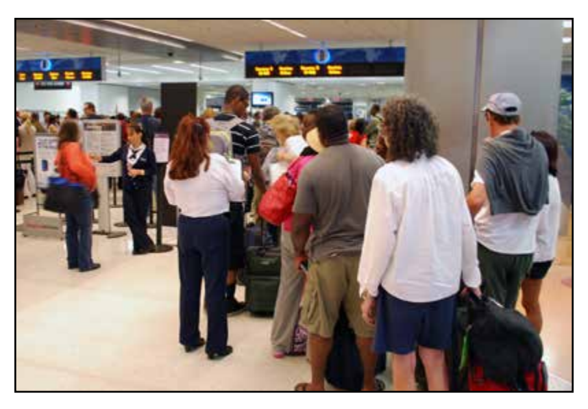
Next, I will go through the security checkpoint.