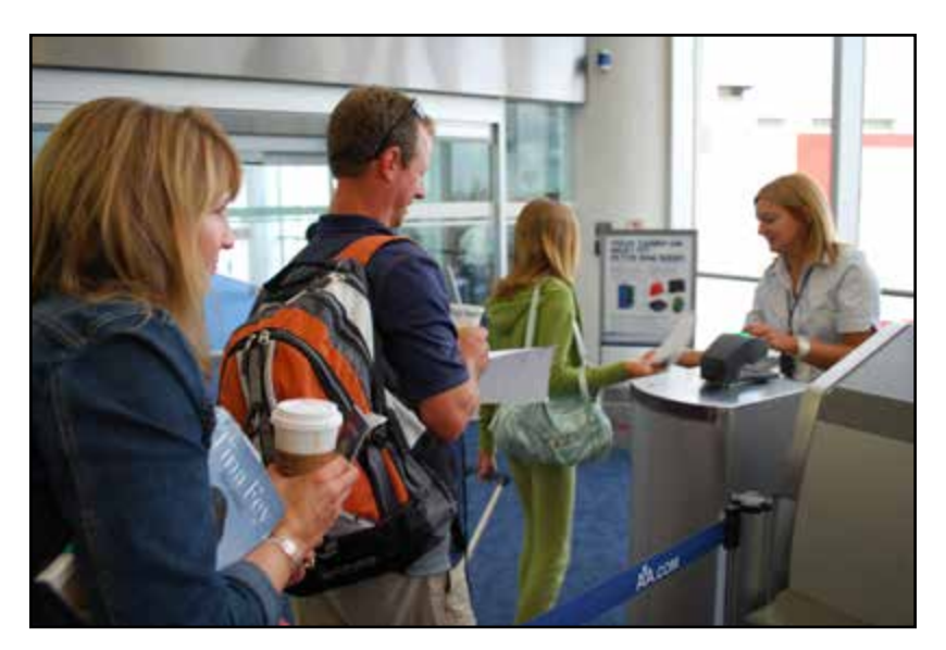
Once I hear the call for my boarding zone, I will line up to board the plane.