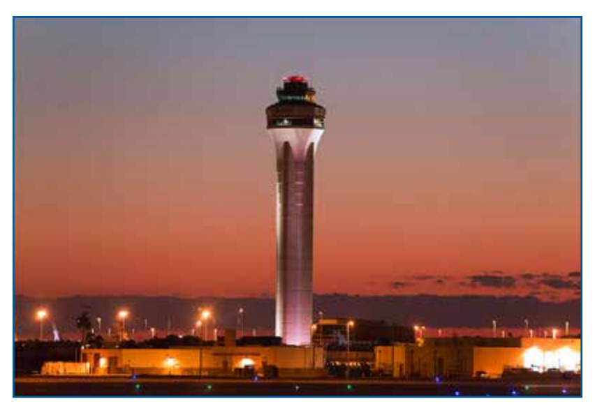
Wow! I had a great time traveling at the Miami International Airport.