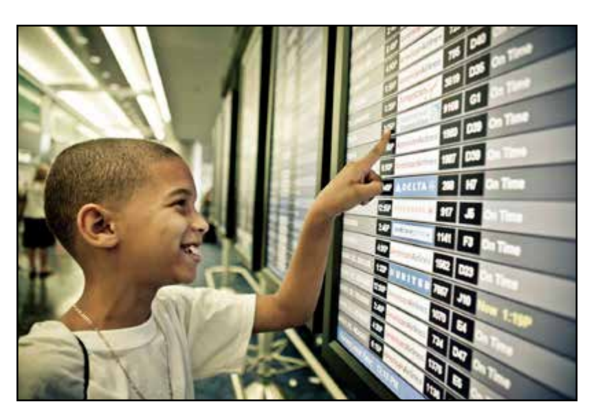
Sometimes flights are delayed and that's okay. I can check my flight's status on the teleprompters (screens).