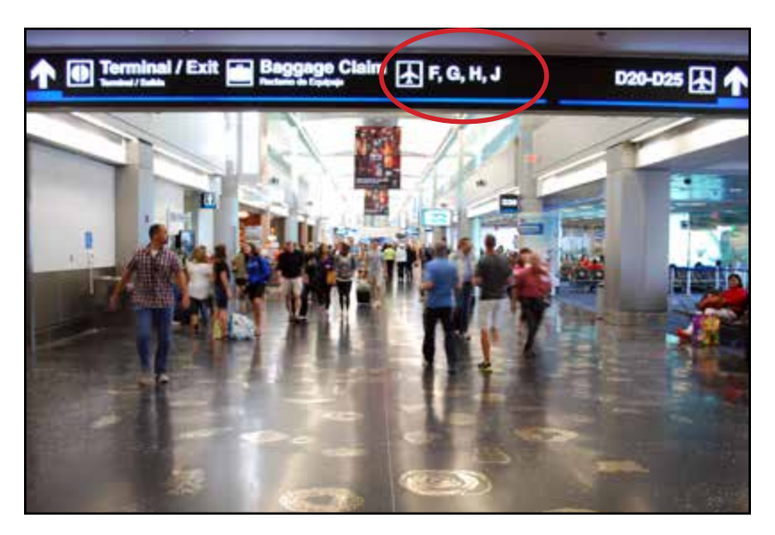
Then, I will walk through the airport to find my gate. I will wait at the gate until it's time to board my plane.