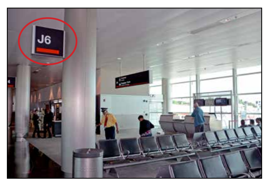
The gate is labeled by letters like D, F, G, H, J and numbers like 1, 2, 3, 4, 5, 6.