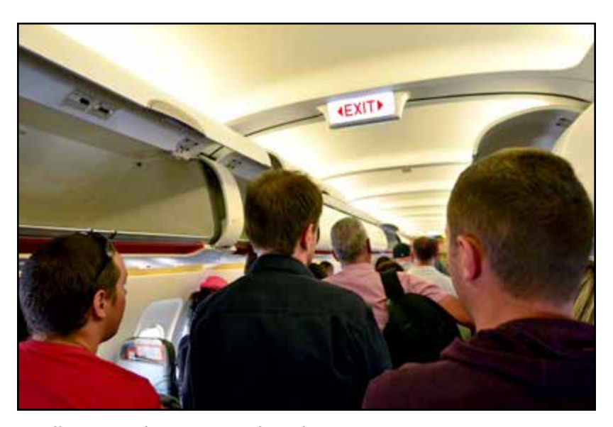
I will wait in line to exit the plane.