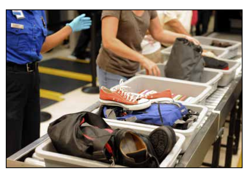
I will put these items in a bin.

After waiting in the security checkpoint, I will have to empty my pockets. I may need to take off my shoes and any other items the TSA instructs me to take off (examples: hat, jacket, belt, watch, jewelry).