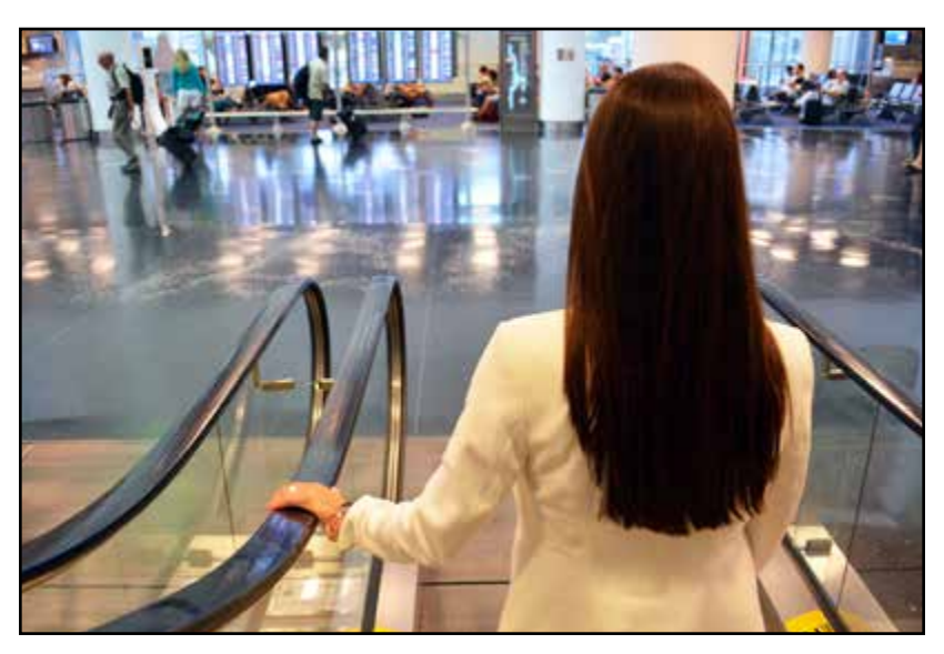
Hold on to the rail!