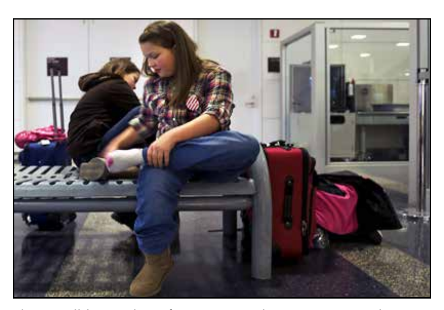
There will be a place for me to sit down to put my shoes back on and any other items I had to take off.