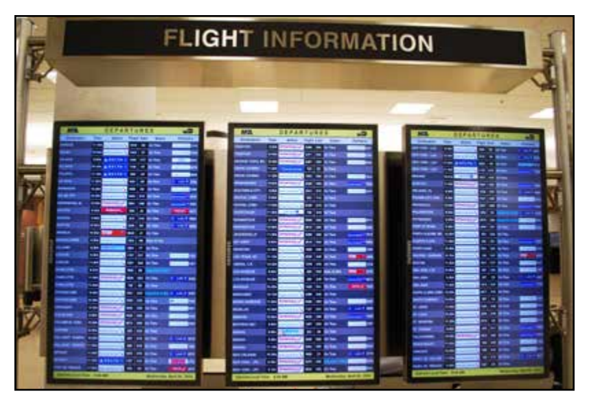
Once I find my gate, I can check to see if my flight is on time.