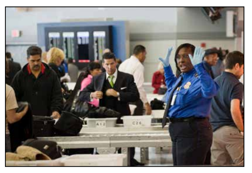
After I walk through the metal detector, I will gather my things from the bins.