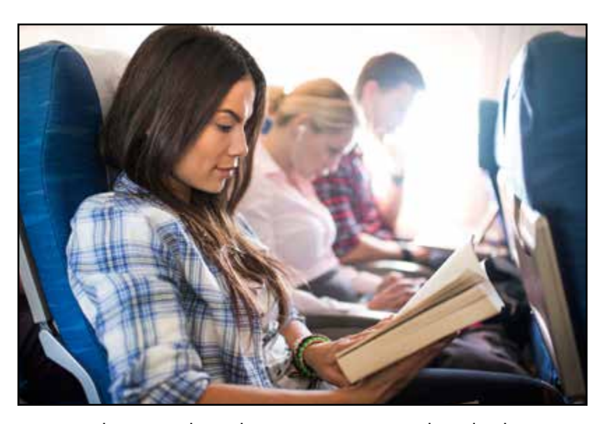
I can recline my chair, listen to music, read and relax on the flight.