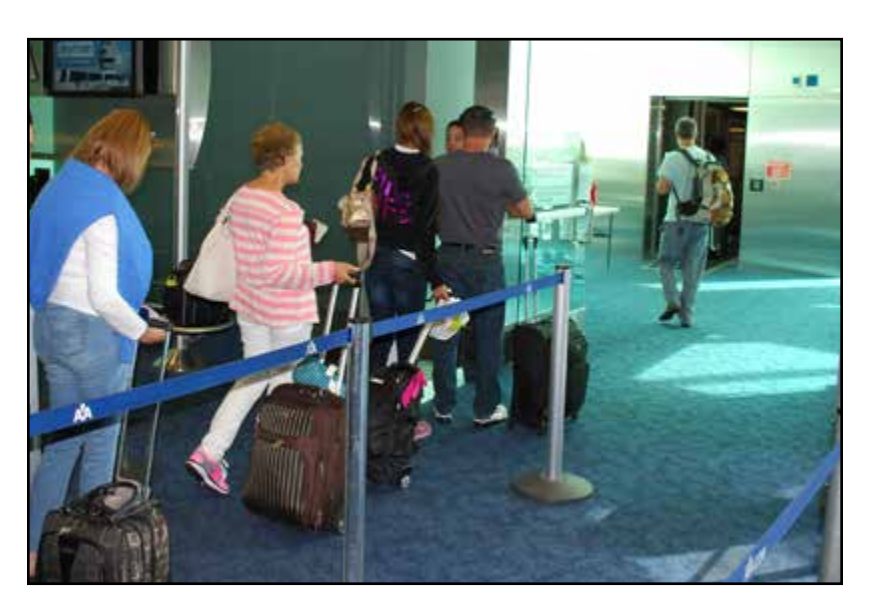
An airline employee will scan my boarding pass and I will walk into a hallway which leads to the plane.