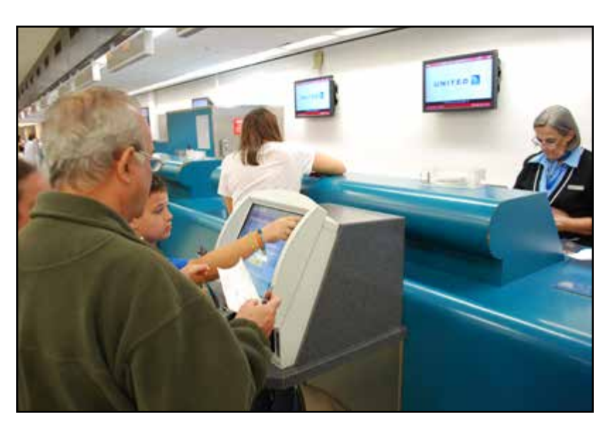
At the ticket counter, I can use the electronic kiosk to check in for my flight. The kiosk will print out my boarding pass.