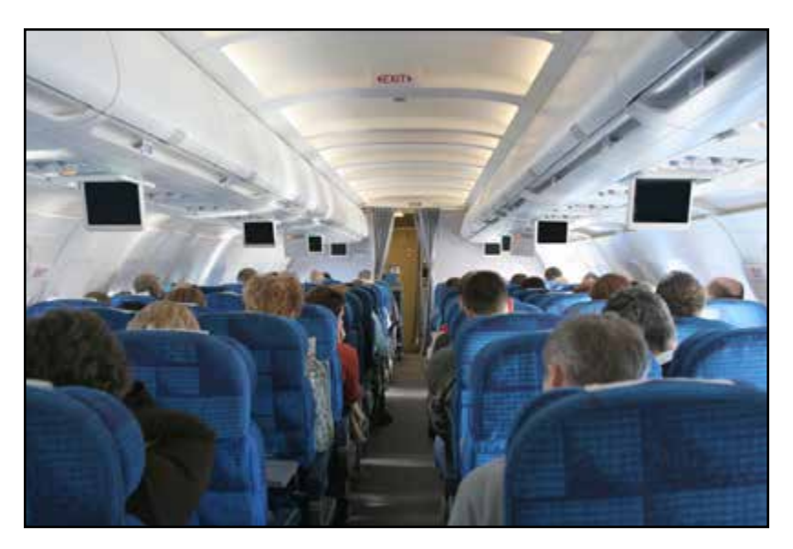
While flying, I may feel a few bumps on the airplane. This is called turbulence. I will need to stay seated.