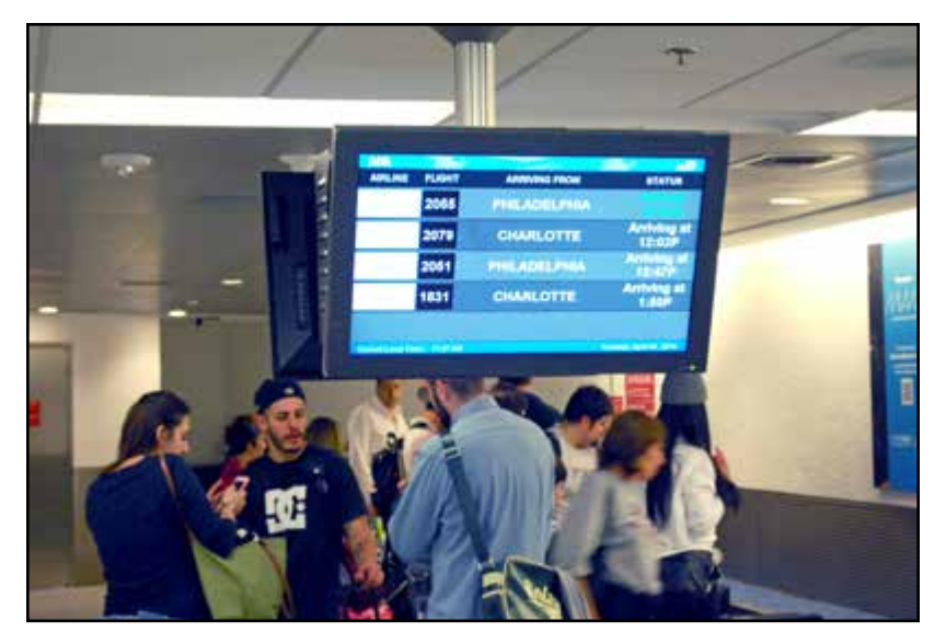
Once I arrive at the baggage claim area, I will look for my flight number on the screen by the carousel.