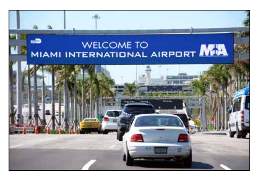
First, I will go to the Miami International Airport.