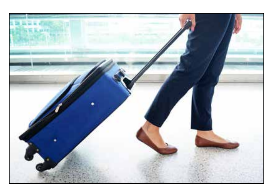
Now, I will take my luggage and leave the airport.