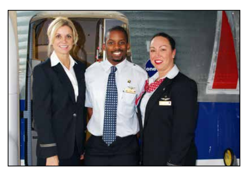
As I board the plane, I can wave hello to the pilot and flight attendants who will greet me.