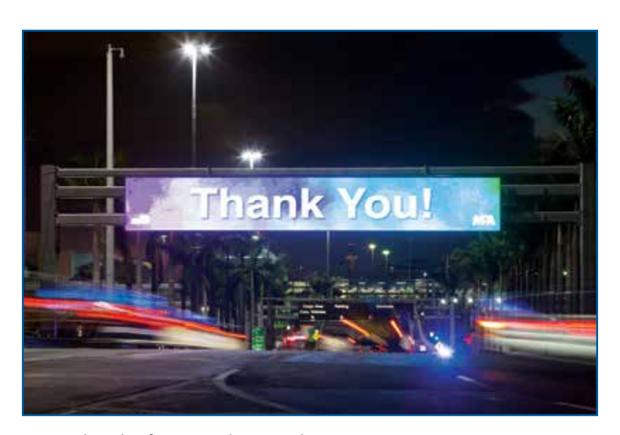
Bye! Thanks for traveling with us.