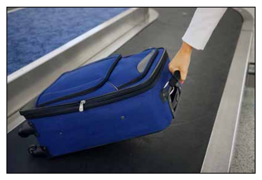
Once I see my luggage, I can take it off the carousel.