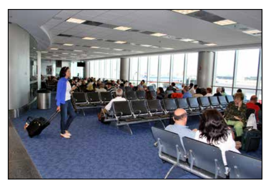
After I check my flight's status, I will wait to board my flight.