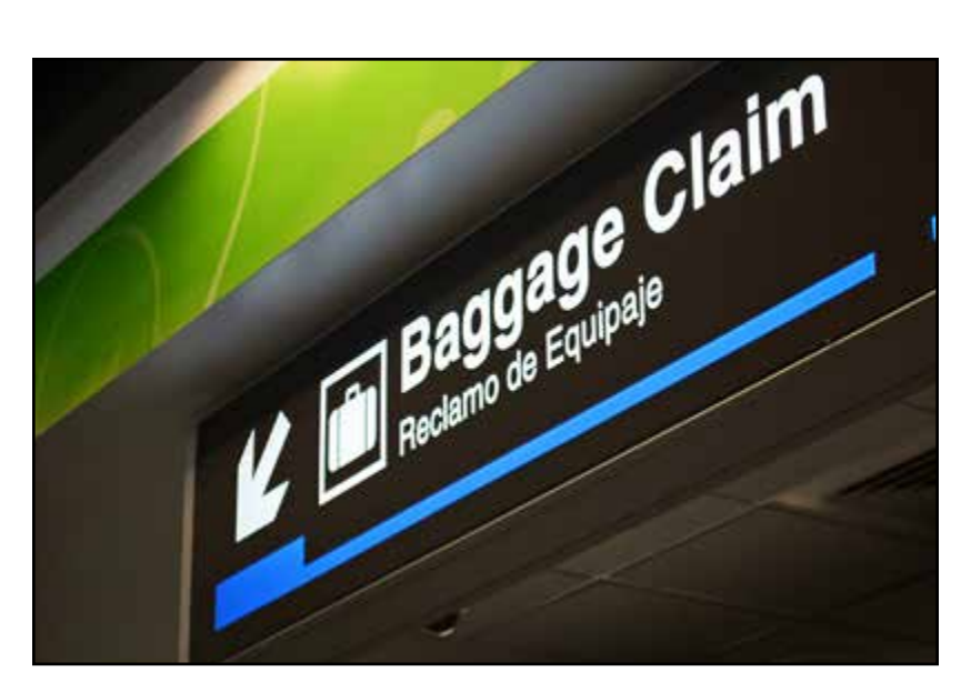
I may have to take an escalator to get down to the baggage claim area.