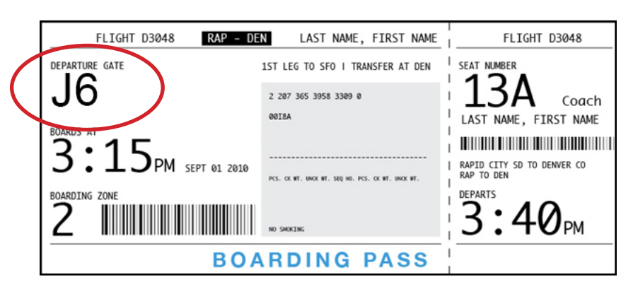
My gate number is on my boarding pass.