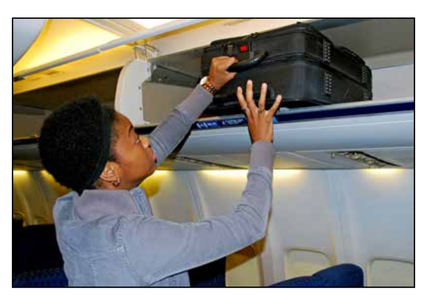
If the luggage doesn't fit, I can put it in the overhead compartment.