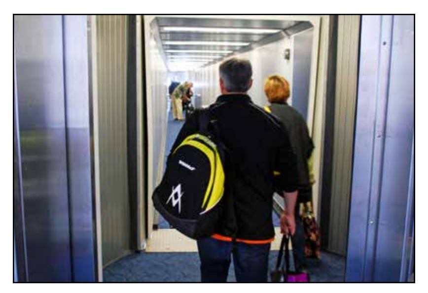
Now, I am ready to board the plane. I will walk down a long hallway to reach the plane.