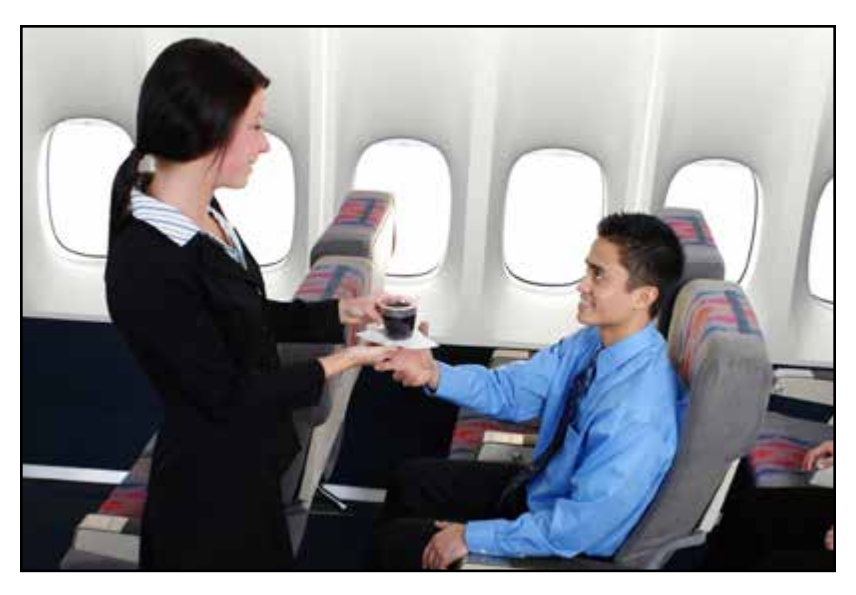
Flight attendants will provide a beverage during my flight. Sometimes, they may offer a small snack.