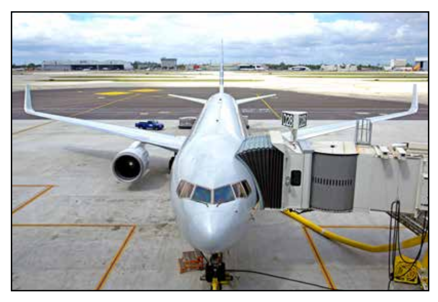
Now, I will get off the plane. I will do this when the plane ride is over.