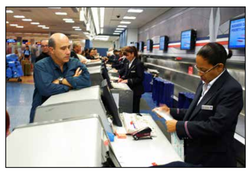
Once I reach the ticket counter, I will check in for a flight.