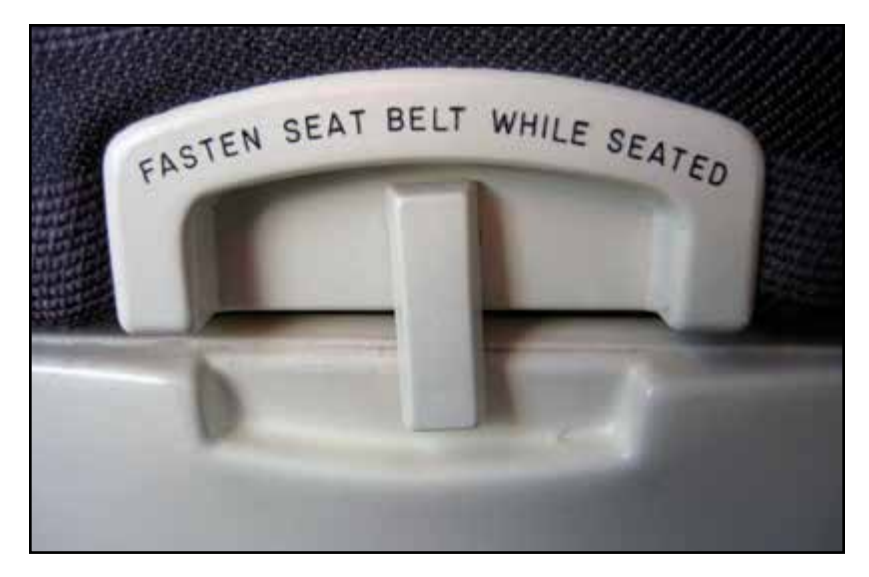
During my flight, I should stay seated with my seatbelt buckled unless I have to use the restroom.