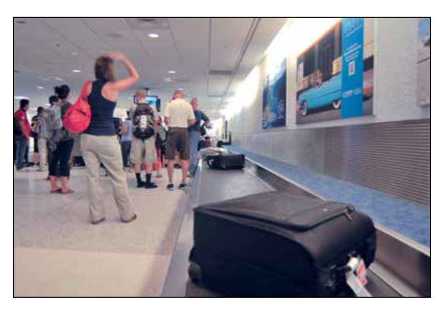
The carousel will carry my luggage out.