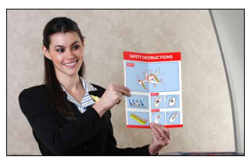
The flight attendant will review the rules of the plane. Then, I will have to turn off my electronics when the plane is ready to take off.