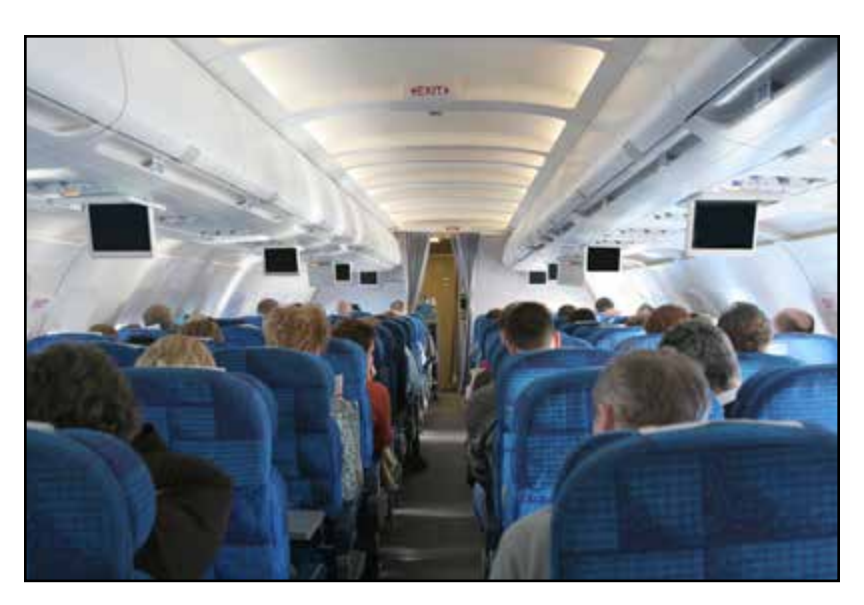
I will need to be patient while waiting. Sometimes, the plane may be warm.