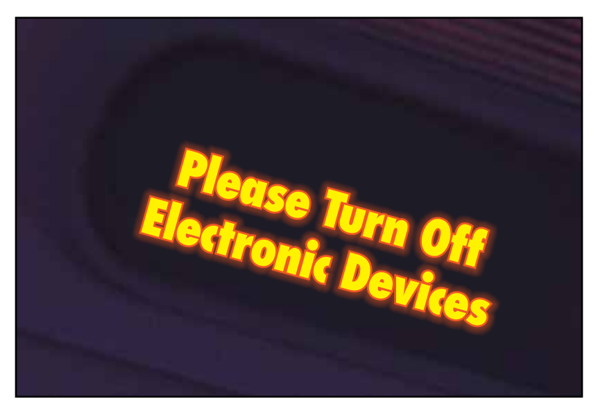
The flight attendant will make an announcement when I am allowed to turn my electronics back on.