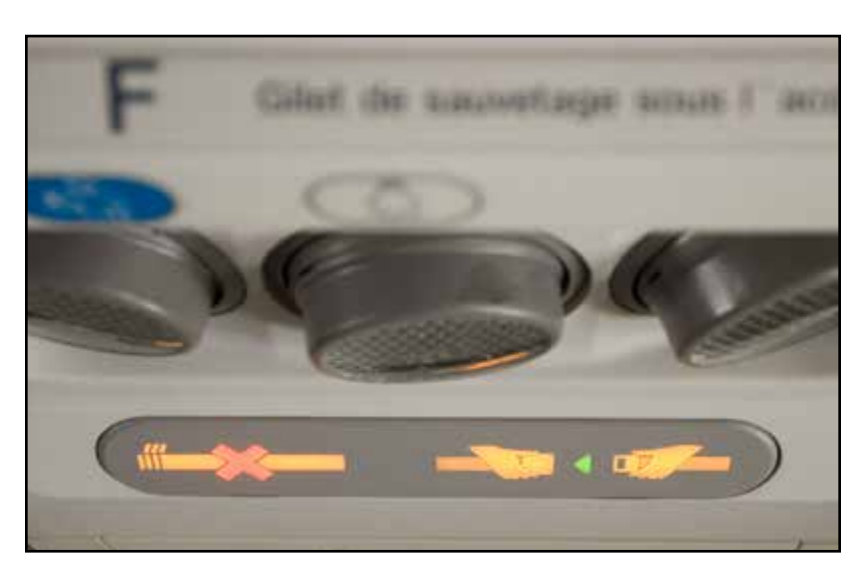
If I have to use the restroom, I should check the seatbelt light located above me. If it is lit up, I will need to stay seated until the pilot turns it off.