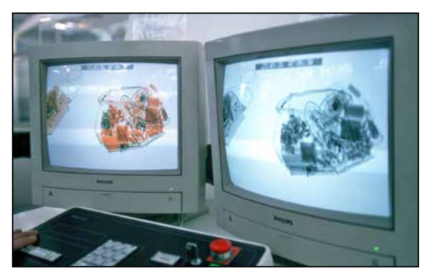
Don't worry, I will get all my things back after they go through the X-ray machine.