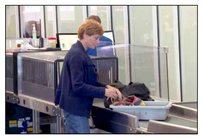
If I am carrying other bags or electronics, they will also need to go into a bin.