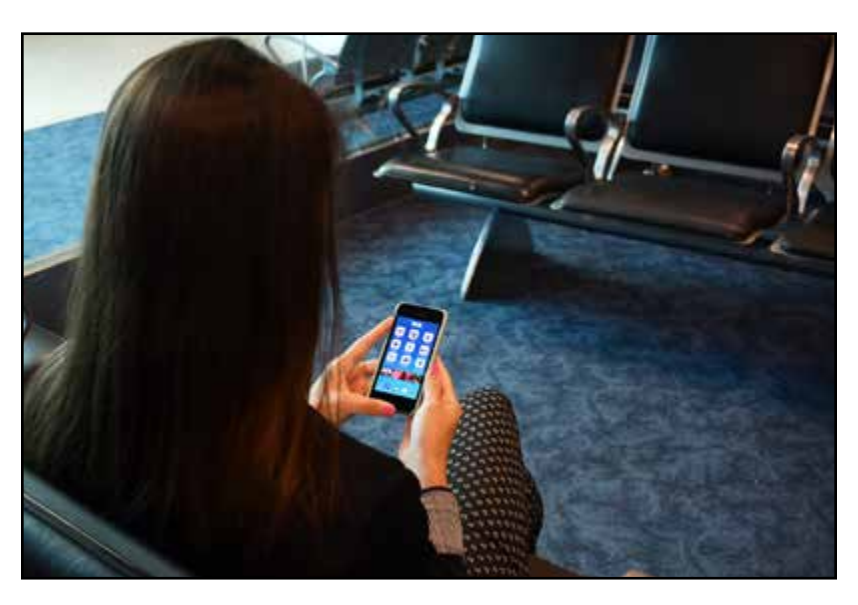
I can sit in any of the open chairs at my gate. While waiting, I can read a book, listen to music, or play a game.