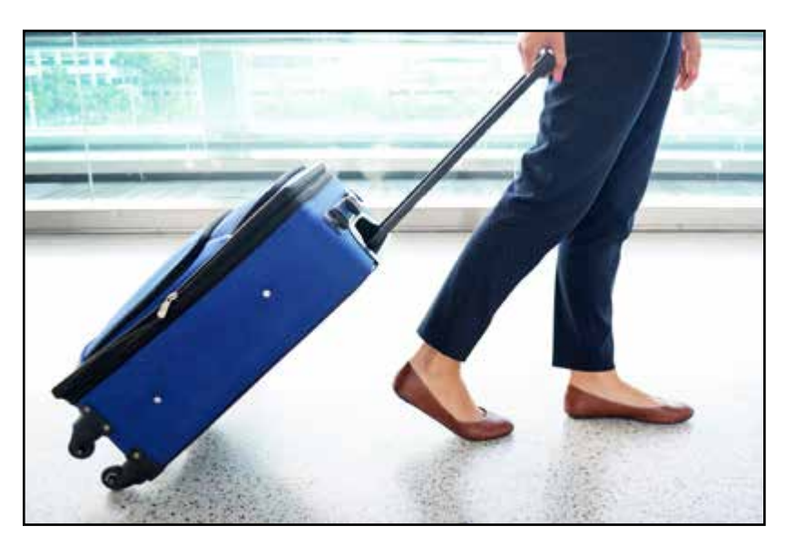
When I arrive, I will take my luggage and walk to the ticket counter.